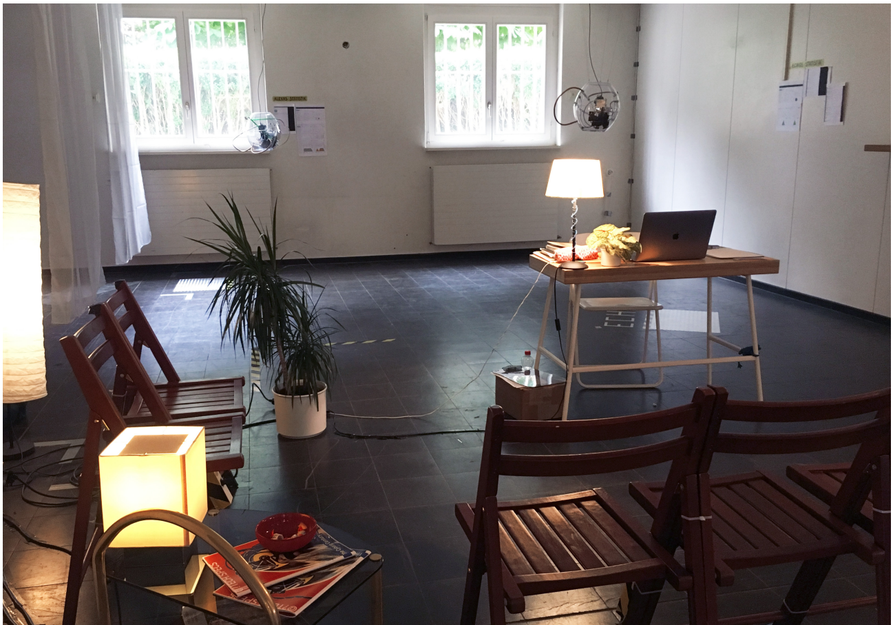
Picture of the installation